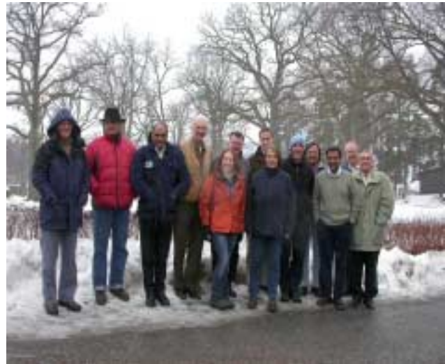
The PWG at Sanga-Saby conference center in Stockholm, Sweden.

Members of the working group did not take positions on any of the topics discussed at this first meeting. They will be working between meetings to consult with stakeholders to ensure that all topics are addressed during the review, and to be informed on the issues.